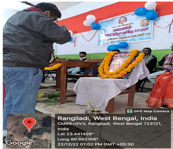
(IKS: Seminar on Santali Language Day)