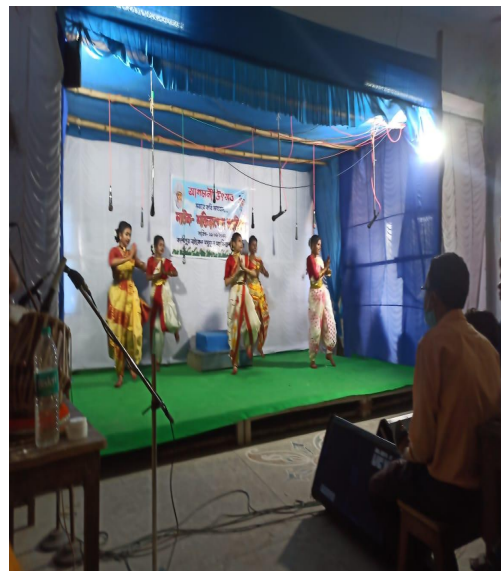
(Presentation on Devi Durga: Mahisasuramardini)