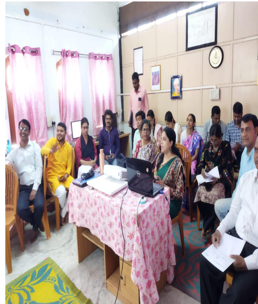
(Research Methodology on SPSS)