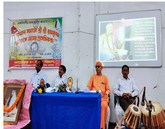
(IKS on Ramakrishna Paramhansa)