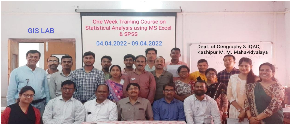
(Training Program on Research Methodology by the Department of Geography)