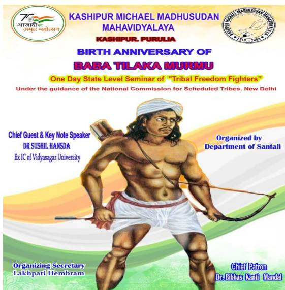
(Seminar on Baba Tilka Majhi)