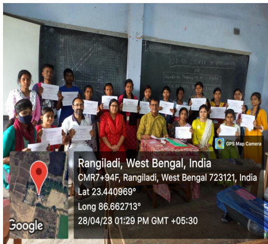
(RM: Hands-on Training on MS Office)